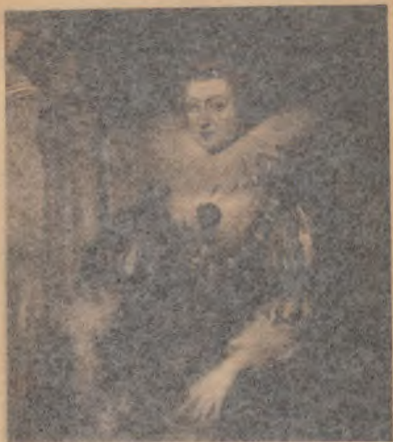
Christina of France Queen of France